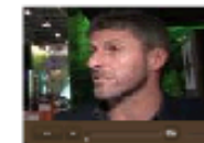
Andy Townsend - Ex-football player