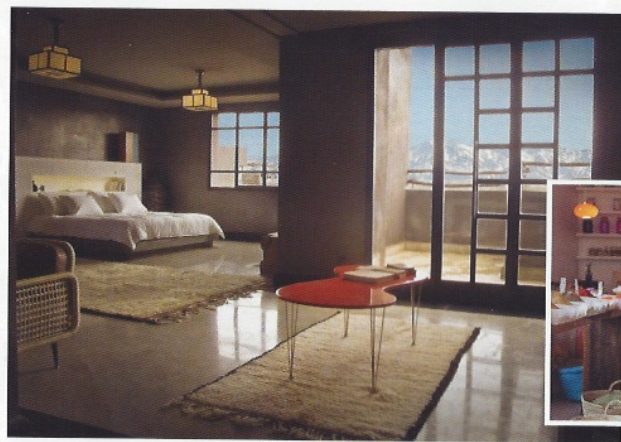
Clockwise from top left: traditional Sumbanese houses in west Sumba, Indonesia. A pool villa at Nihiwatu, Indonesia. A farmer who supplies the spice shop at the Fellah, Marrakech. One of its suites