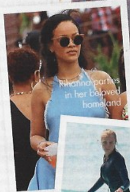
Rihanna parties in her beloved homeland