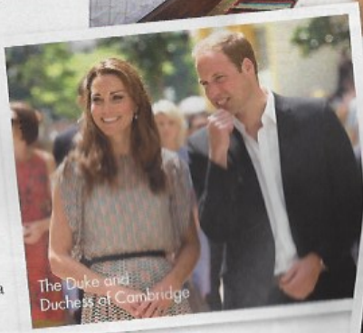
The Duke and Duchess of Cambridge