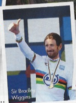
Sir Bradley Wiggins