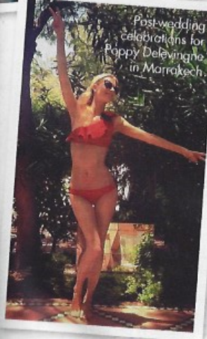
Post-wedding celebrations for Poppy Delevingne in Marrakech

THE DETAILS Luxury Worldwide Collection (tel: 0208-421 7020; luxuryworldwidecollection.com ) offers six nights at Mandarin Oriental Marrakech ( mandarinoriental.com ) from £989 per person, based on two sharing, including return flights, transfers and B&B.