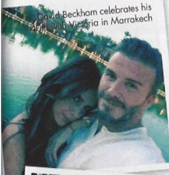
David Beckham celebrates his 40th with Victoria in Marrakech