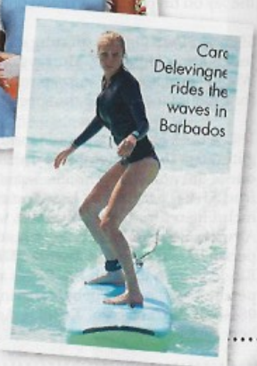
Care Delevingne rides the waves in Barbados