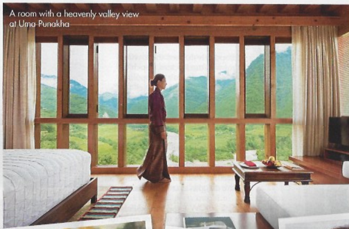
A room with a heavenly valley view at Uma Punakha

THE DETAILS Stay at Uma Punakha and Uma Paro, both by Como ( comohotels.com ), one of the world's leading creators of luxury resorts. Ampersand Travel (tel: 020-7819 9770; ampersandtravel.com ) offers an 11-day tour visiting both from £5,440 per person, based on two sharing, including return international and domestic transport, B&B accommodation and tours. Alternatively, Responsible Travel (tel: 01273 823 700; responsibletravel.com ) offers the eight-day Bhutan Holiday on a Shoestring from £1,190 per person, based on two sharing, excluding flights.