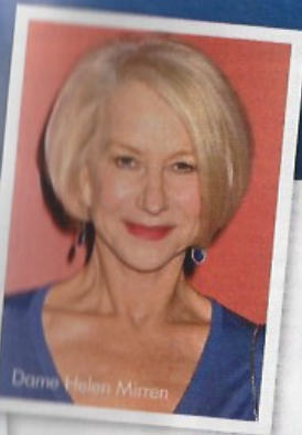
Dame Helen Mirren