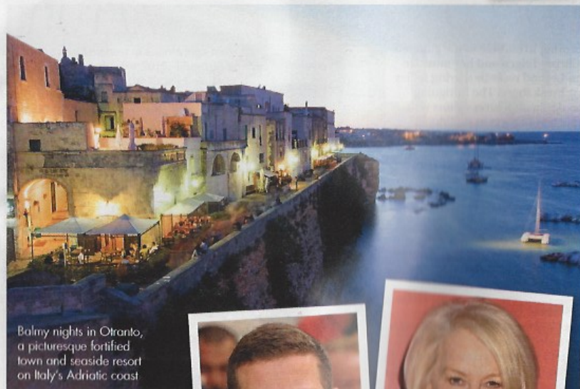
Balmy nights in Otranto, a picturesque fortified town and seaside resort on Italy's Adriatic coast