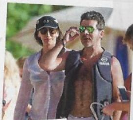
Simon Cowell and Lauren Silverman on the beach at Sandy Lane

THE DETAILS One of the best addresses on the west coast, The Sandpiper ( sandpiperbarbados.com ) has recently added three ocean-front suites and a 200ft lap pool. Seven nights cost from £2,015 per person, based on two sharing, including return flights, transfers and B&B with Elegant Resorts (tel: 01244-897 991; elegantresorts.co.uk ). Alternatively, seven nights at couples-only Sandals Barbados ( sandals.co.uk ) costs from £1,529 per person, based on two sharing, including return flights, transfers and all-inclusive accommodation with Virgin Holidays (tel: 0344-557 4321; virginholidays.co.uk ).