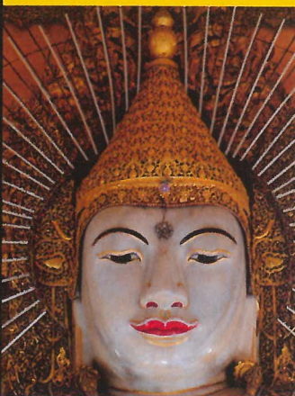
Beautiful Bagan is steeped in history