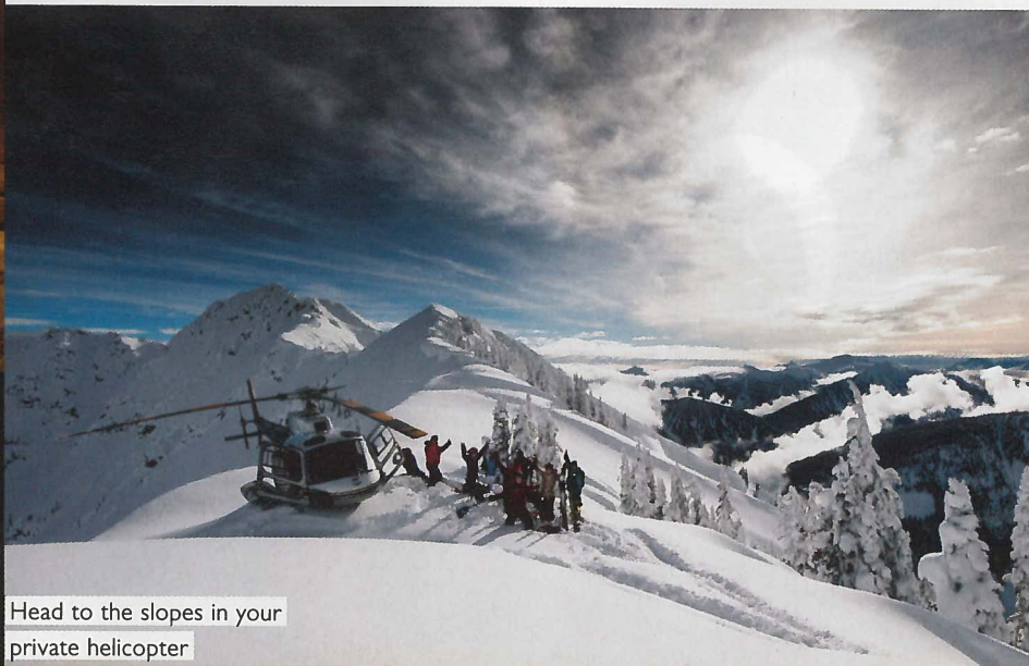
Head to the slopes in your private helicopter

THE LOWDOWN Bighorn starts at £38,000 for a week for 16 people including gourmet meals ( bighornrevelstoke.com ).