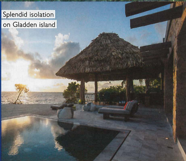
Splendid isolation on Gladden island

It's not hyperbole to call Gladden uber-luxe. For starters, you get the whole island, off the coast of Belize, to yourself. The elegant villa has uninterrupted views of the ocean, white sandy beaches, a pool and two huge bedrooms, should you deign to share. The only interruptions to this sanctuary come when hosts Adam and Annika arrive from a nearby island – a 'privacy meter' lets you know of their arrival, ensuring maximum seclusion. Annika will feed you whenever or wherever you want – from poolside tapas to an elegant supper on the beach using freshly caught fish and vegetables grown on-site. Adam is your man for paddleboarding, snorkelling and scuba diving, plus he'll arrange bespoke speedboat trips. Highlights include Gladden Spit, a haven for whale sharks, and King Lewey's Caye, a nearby pirate-themed island with amazing food and a lively atmosphere. However you choose to spend your time, it's all included. THE LOWDOWN From £2,242 for two people, per night ( gladdenprivateisland.com ). Stay for seven nights and the £1,370 private helicopter transfer from Belize City is included.