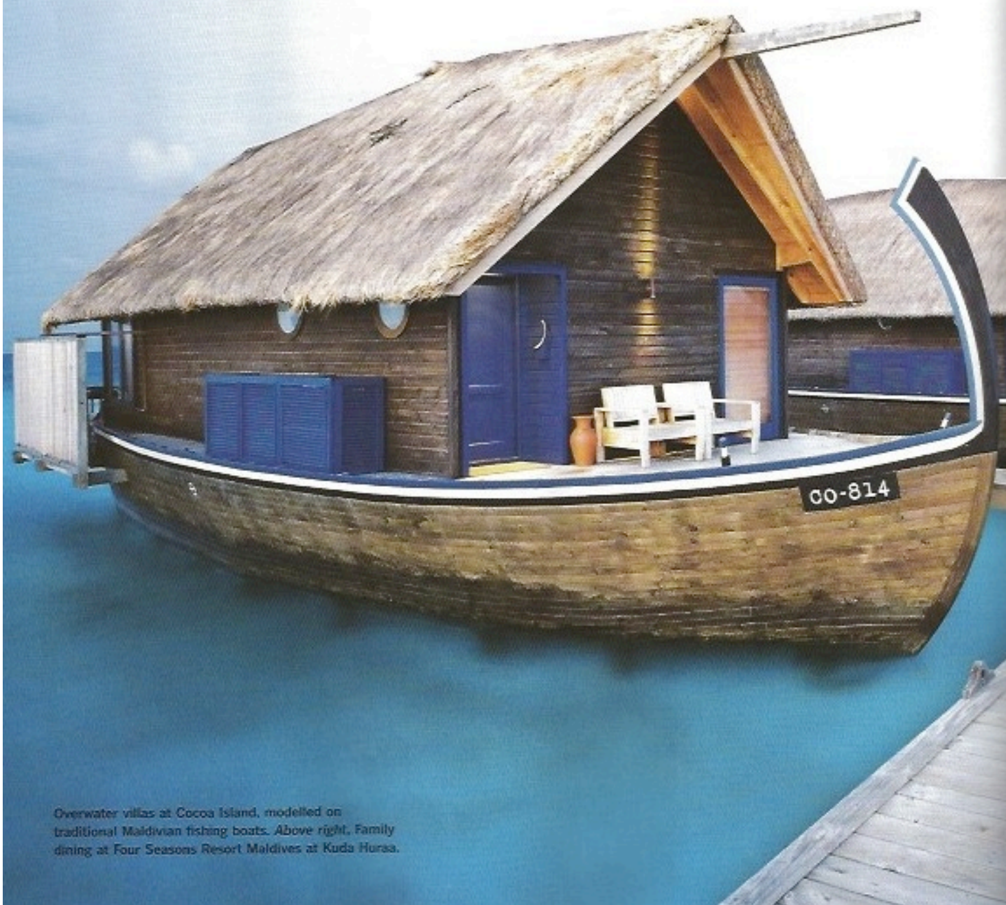
Overwater villas at Cocoa Island, modelled on traditional Maldivian fishing boats. Above right, Family dining at Four Seasons Resort Maldives at Kuda Huraa.

Baa Atoll. From Malé a seaplane conveys you to a lush world-apart: Landaa Giraavaru island is set beside a very large, very clear lagoon in the particularly remote and undeveloped eastern side of Baa Atoll. There is plenty of space here for the 102 thatched beach and water villas, each with private, open-air living areas. The service is discreet and sensitive, and staff will happily arrange anything from reconnection rituals at the spa to castaway-style picnics on a desert island nearby. www.fourseasons.com/maldives , Elegant Resorts (01244 897538; www.elegantresorts.co.uk ) offers seven nights from £3,845 per person, based on a November departure