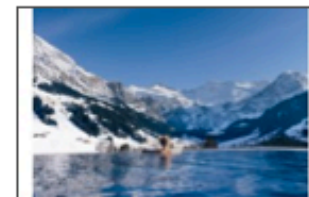
New Weekend Destin...