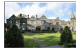
Simonstone Hall, Y...