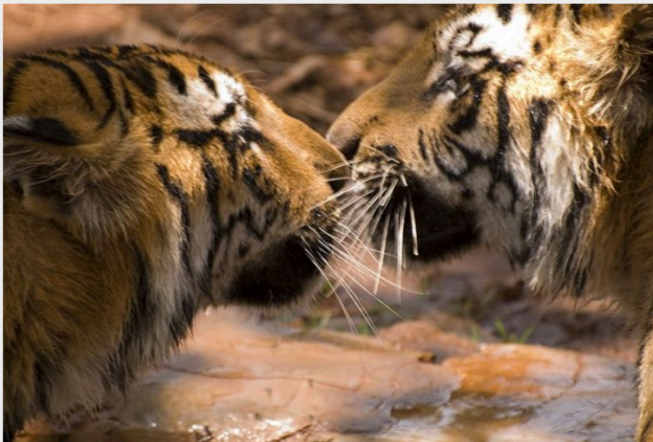
Bengal tigers at Karnataka Reserve