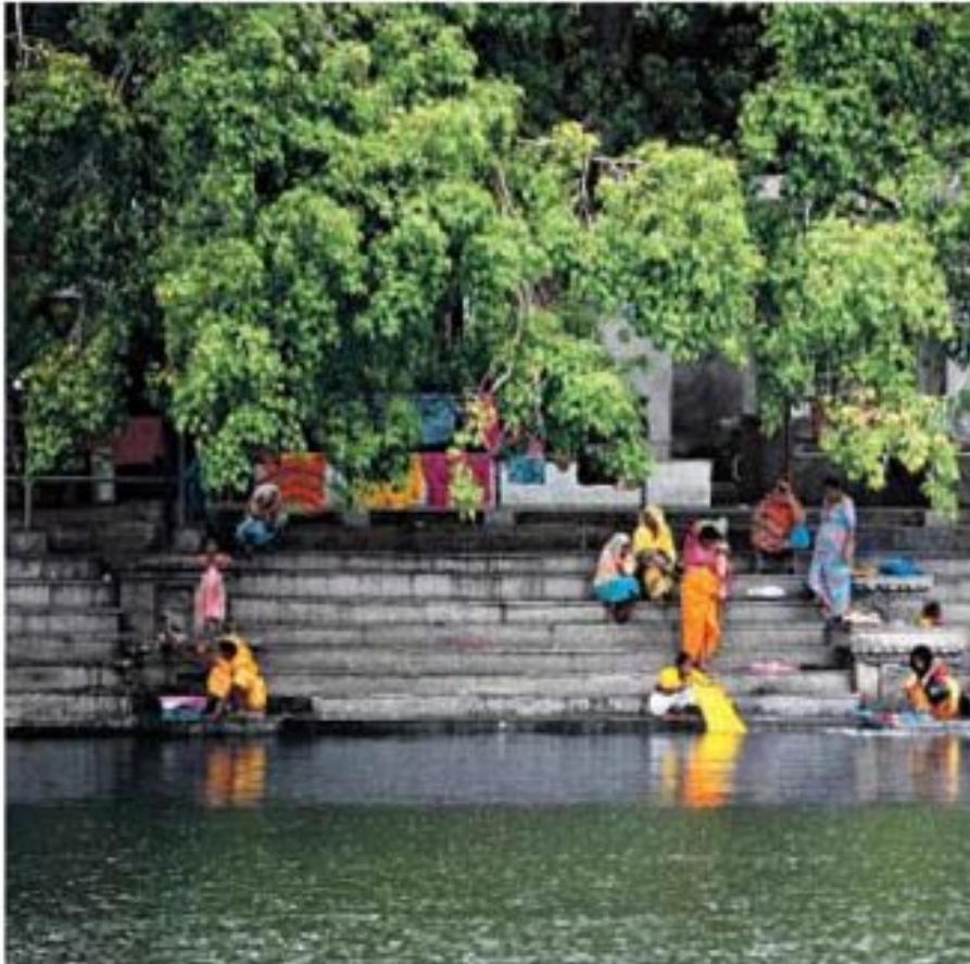
Full spectrum: (clockwise from main) temples in Jaisalmer; the River Ganges; Palace On Wheels luxury train; the Lake Palace, Udaipur; Jodhpur