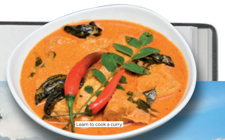
Learn to cook a curry