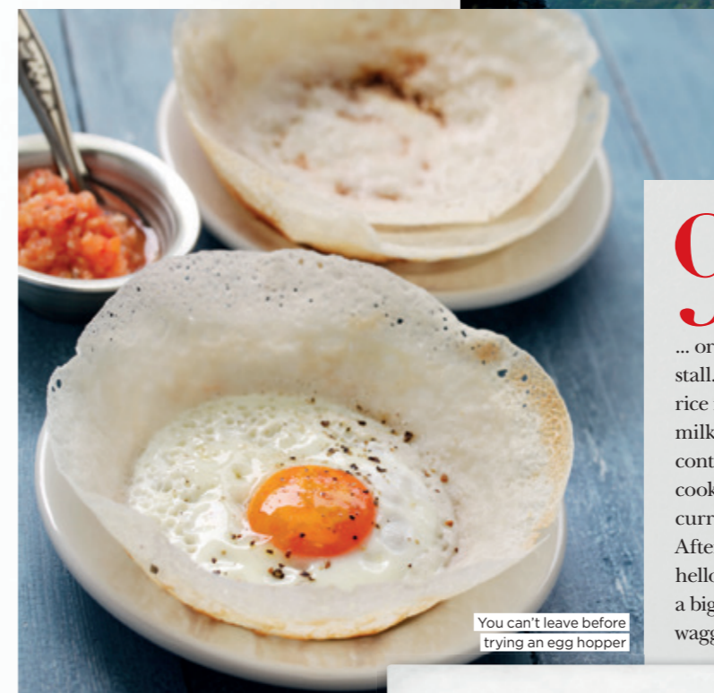
You can't leave before trying an egg hopper

Pepper organises everything from cooking curry in a wattle and daub home, with lotus leaves for plates, to climbing sacred Adam's Peak in time for sunrise. On Christmas Day we hiked with a guide, appropriately named Santa, to a waterfall in the Kanneliya Rainforest and had lunch at a table planted in the river. We saw chameleons, snakes and monkeys and one of us (me) attracted no less than three leeches. 'Very good for your health,' beamed Santa when I showed him my blood-soaked trousers. pepper.life