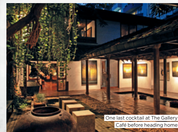
One last cocktail at The Gallery Café before heading home

Developed by style arbiter Shanth Fernando, creator of Paradise Road shops, restaurants and hotels, from the offices of revered architect Geoffrey Bawa, this is the coolest hangout in town. Just the place to while away the evening before the night flight home. paradiseroad.lk