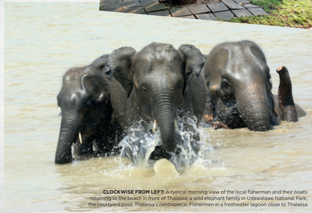
CLOCKWISE FROM LEFT: A typical morning view of the local fishermen and their boats returning to the beach in front of Thalassa; a wild elephant family in Udawalawe National Park; the courtyard pool, Thalassa's centrepiece; Fishermen in a freshwater lagoon close to Thalassa

beach.' Property is currently still around five times cheaper than anything comparable in Phuket or Bali.