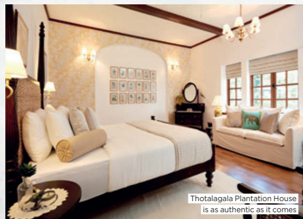
Thotalagala Plantation House is as authentic as it comes

Thotalagala, opened in 2016, is another planter's bungalow but this one is authentic, its layout unchanged since it was built, with original features such as fireplaces, panelling, furniture and pictures from the period, full of character. And since it's part of Sir Thomas Lipton's beautiful Dambattenne tea estate, guests can have a private tour of the Scottish magnate's hardly changed 1890 factory and take tea, served by a butler, at a linen-clothed table on the lawn of his manicured garden. If mustachioed Sir Thomas, who brought tea to Britain's working classes through his Liptons' stores, had emanated from the French doors of his splendid, frozen-in-time bungalow, I would not have been remotely surprised. thotalagala.com