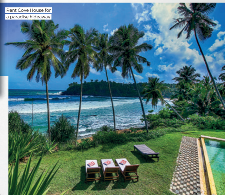
Rent Cove House for a paradise hideaway

Surrounded by grassy ramparts, spacious, laid-back, arty Galle Fort is full of historic buildings dating from the Dutch occupation of the 17th century and full of jewellery shops, art galleries and cafés. Its multi-ethnic, multi-religious population and tranquil air make it a place to linger. Take tea under a whirring fan in the Galle Fort hotel, a colonial haven set in an old gem merchant's mansion ( galleforhotel.com ). The slick Amangalla ( aman.com ), set in another fine colonial building, is almost next door, but for a step back in time, complete with aged waiters in white coats and black bow ties and original stone fountains and aviaries, head for Cloisenberg Hotel overlooking Galle Harbour ( cloisenberghotel.com ).