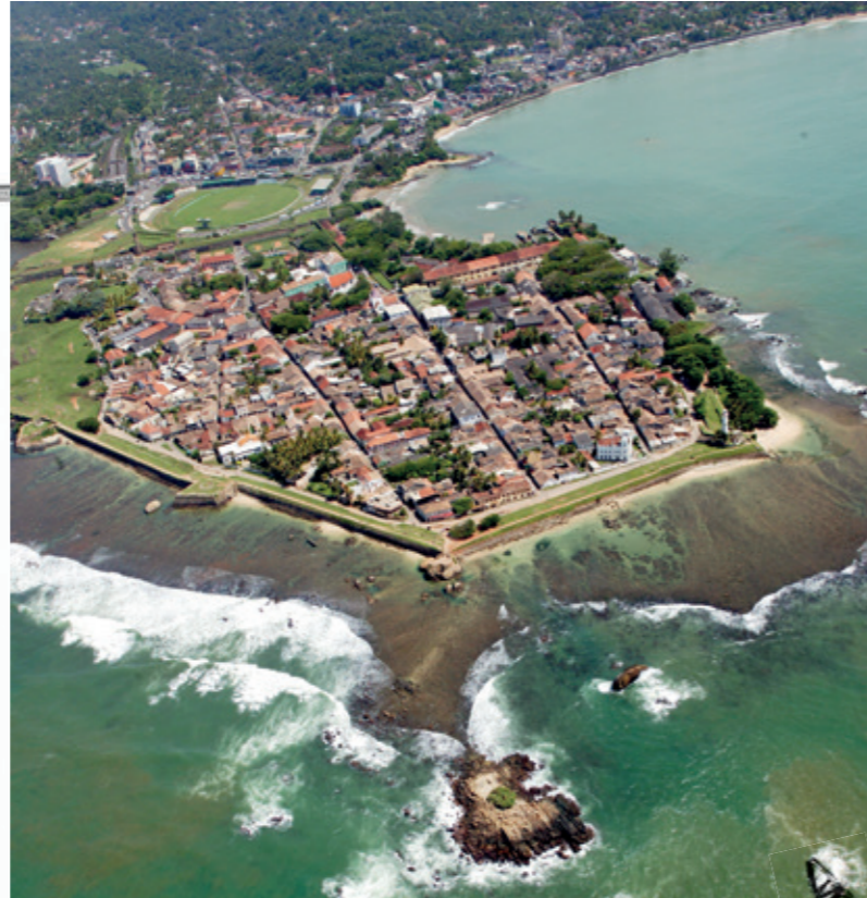
Galle is full of historic buildings

Hidden away near Dikwella on the south coast, Hiriketiya Cove is ringed by palms and coconut trees, dotted with beach cafés, with waves for both beginners and experts. Cove House and Little Cove, sleeping six and four respectively, overlook the bay. They come air-conditioned, each with a pool and fully staffed, with an excellent chef. Evenings are magical: lamplight, sunset, cheeky monkeys, huge bats flitting among the trees and fireflies. covehouses-srilanka.com